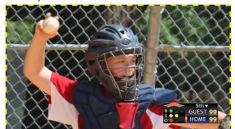
Dynamic Zoom combines Optical Zoom plus Pixel Mapping—focusing on a smaller image area for lossless 24X Zoom