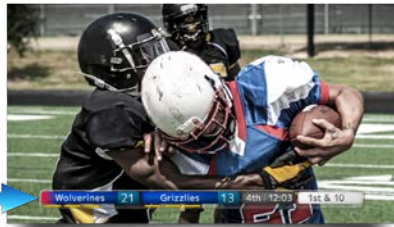
The camera receives score info directly from a mobile device

The GY-HM200SP produces a real-time score overlay on recorded or streamed video output for a variety of popular sporting events including football, soccer, volleyball, hockey and more. The overlay is produced for both the streamed and recorded video simultaneously.