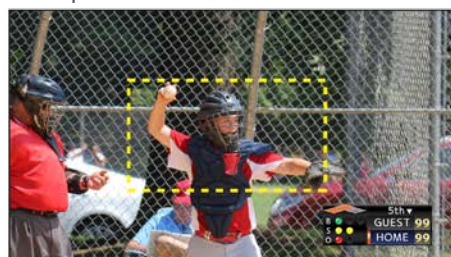
24X Dynamic Zoom in HD Mode