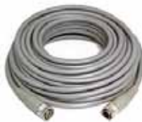
Camera cable VC-P110U:5m VC-P112U:20m VC-P113U:50m VC-P114U:100m