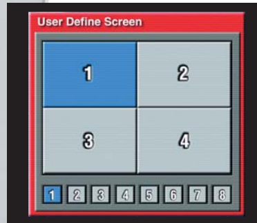
User define screen menu