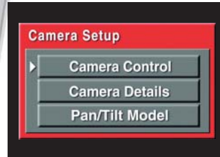
Camera setup menu