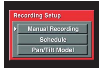
Recording setup menu