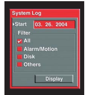
System log menu