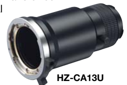
HZ-CA13U 16mm Film Lens Adapter

With ProHD, the dream of creating HD video with the essence of film has at last been realized. By capturing and recording at the film frame rate of 24fps, and offering extensive user configurable settings such as exposure, gamma and detail, ProHD becomes an important tool for creative expression. For the ultimate form of display on the cinema screen, 24 frame progressive recordings can be readily transferred to 16 mm or 35 mm film. The optional HZ-CA13U Film Lens Adapter further empowers digital filmmakers by enabling the use of 16mm film lenses with a PL mount.