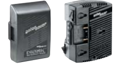
■ Dionic 90 (Battery) ■ Titan70 (Adapter)