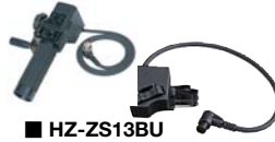
■ HZ-ZS13BU Cannot be used for HTs18x4.2BRM lens. Use Fujinon ZMM-6; Module unit/C2H-14; Grip/CFC-12-990; Cable/MCA-7; Mounting clamp ■ HZ-ZS100U (Handle zoom)