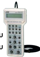
■ RM-LP55U (Handheld) ■ RM-LP57U (Desk mount)