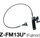
■ HZ-FM13U* (Fujinon) ■ HZ-FM15U (Canon) *The HZ-FM13 cannot be used for S14 and Th16 lenses. Use Fujinon FMM-8; Module unit/CFH-3; Grip/CFC-12-990; Cable