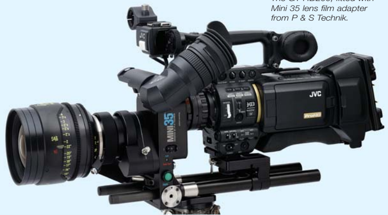
The GY-HD200, fitted with Mini 35 lens film adapter from P & S Technik.

The optional JVC Hard Disk Recorder DR-HD100 creates a dual recording system of tape and hard disk. This system is already utilized by Professional DV users the world over. The many advantages inherent in JVC's dual recording system of tape & hard disk drive are well appreciated. It was only natural that JVC's range of ProHD models would include a Hard Disk Drive recorder and one that can operate equally in DV and HDV modes. The dual recording system provides fast and efficient HDD-based editing and cost-effective tape archiving, using low-cost tapes. Thanks to the newly developed MPEG-2 encoding IC, high-quality pictures can be recorded on readily available compact DV cassettes, so running costs are minimal. As no special equipment or exclusive media are required, the operating costs of the total system can be kept low. The DR-HD100 is mounted at the rear of the camcorder, utilizing an optional bracket which is provided by the leading battery systems manufacturers.