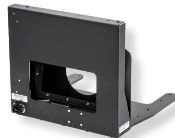
FLT-VS45 Motorized Filter Holder