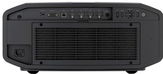
DLA-VS4600 Rear View