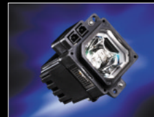
User-replaceable Lamp BHL5010-S