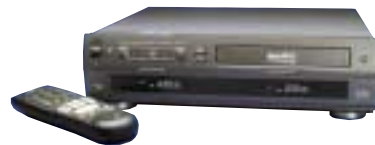
SR-VS10U Mini DV/S-VHS Recorder

For added versatility and convenience (that's also exceptionally economical), JVC also offers the SR-VS10—a MiniDV/S-VHS recorder that allows MiniDV playback and easy dubbing to S-VHS or standard VHS.