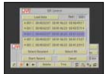
Super Scene Finder lets you log scenes automatically or manually in the field, and mark which scenes are good.

Combine the power and outstanding image quality of PROFESSIONAL DV with the functionality and ease of Draco's Casablanca, and you'll do more...you'll do it better...you'll even do it for less than you ever expected to spend.