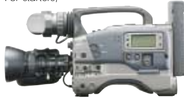
GY-DV500 Camcorder Mini DV

It all begins with acquisition. For starters, there's PROFESSIONAL DV from JVC. The revolutionary GY-DV500 is the industry's first MiniDV camcorder that can truly be called