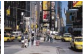
City & Street Scene Surveillance