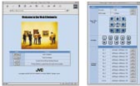
Camera Control Window

*For compatible browsers, please refer to the specifications below.