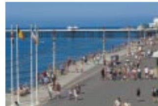
Tourism Location Visuals

From transmission of on-location visuals for tourists to traffic information or live event broadcasts, JVC's Web cameras are the most complete, easy-to-use Internet-ready visual network system available.