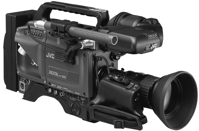
KY-D29U (User-supplied microphone)