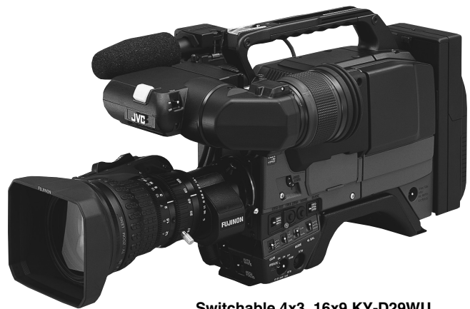
Switchable 4x3, 16x9 KY-D29WU