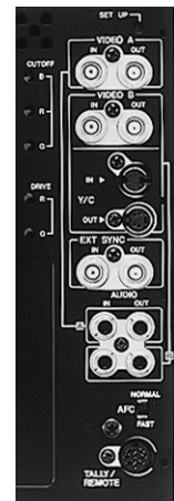
TM-910SU (TM-950DU has no Y/C)