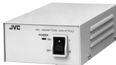
AA-P700U AC adapter