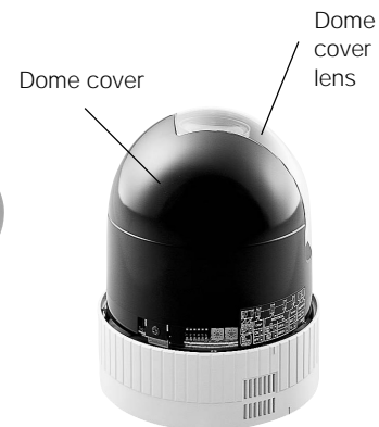
View when the camera body cover is removed.