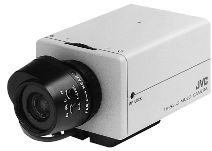
Shown with optional lens