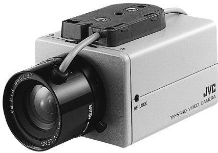
Shown with optional lens