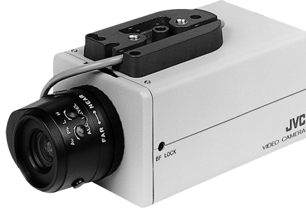
Shown with optional lens