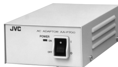
AA-P700U AC adapter