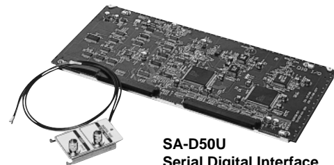
SA-D50U Serial Digital Interface