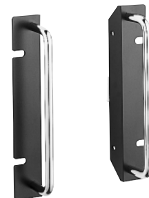
SA-K67U D-9 series Rack Mount