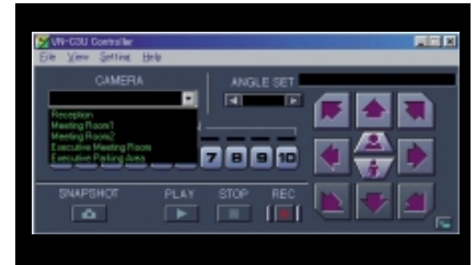
Viewer/Controller Software Installed