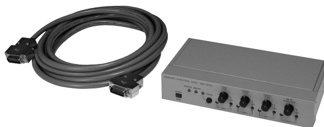
RM-G22U TBC Remote Control Unit