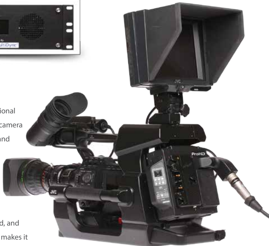
*GY-HM890 full studio configuration

There's never been a more versatile high quality professional camera than JVC's GY-HM890U—an advanced 3-CMOS camera that delivers pristine HD images to solid state memory and streams via Wi-Fi or a plug-in LTE modem. It features a removable 20x Fujinon auto-focus lens, 4 channels of audio, dual memory card recording at up to 50 Mbps, an external HD-SDI pool feed input, and a full complement of fiber and multicore studio options. It's the most feature-rich HD camera JVC has ever offered, and now, the availability of the FS-900 Fiber Remote System makes it truly an essential component of any modern broadcast company.